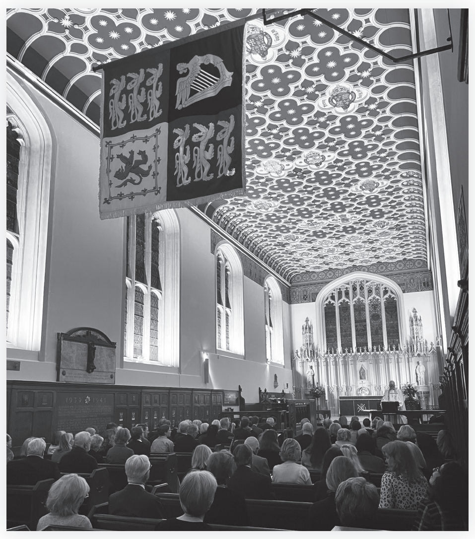
Our first QMCG Carol Service held at The King's Chapel of the Savoy on 4th December 2024.